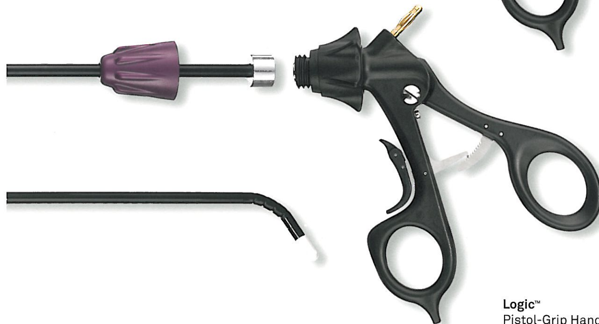
Logic™ Pistol-Grip Handle with Ratchet