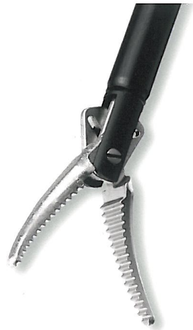
Logi™Dissect Curved Dissector