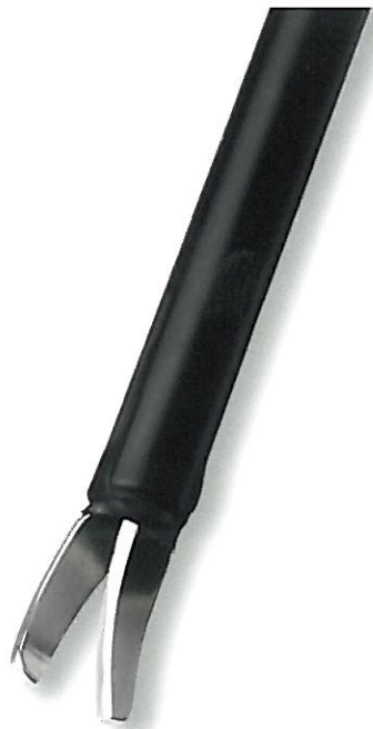
Logi™Cut Mini Scissor