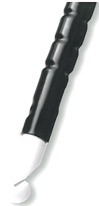
Logi™Flex Gastric Band Retriever