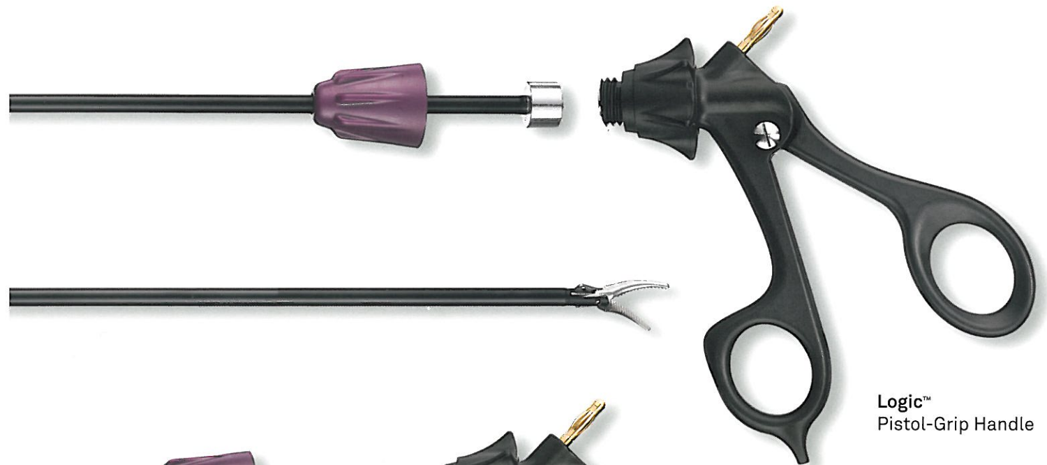
Logic™ Pistol-Grip Handle