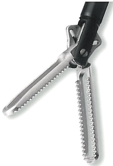
Logi™Grasp Fenestrated Grasper