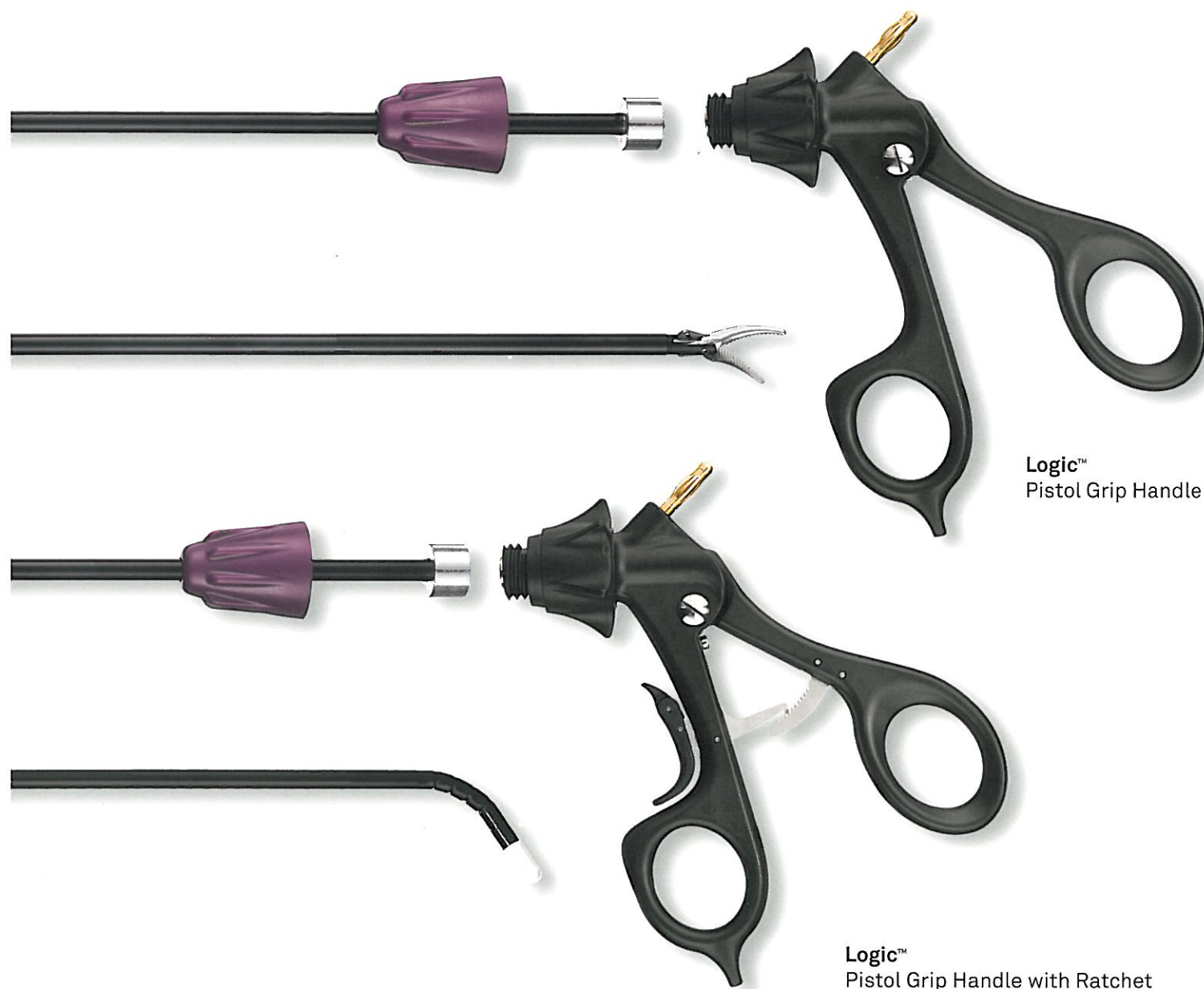
Logic™ Pistol Grip Handle

Logi™Range. The high performance, cost-effective solution.