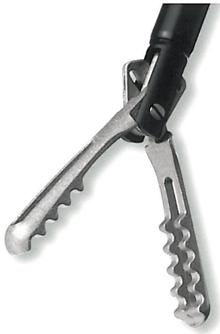
Logi™Clinch Atraumatic Grasper